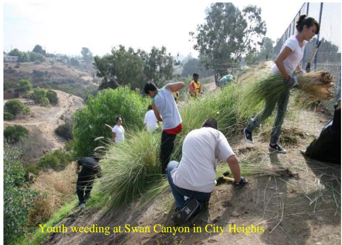
Youth weeding at Swan Canyon in City Heights

Through collaborations with other non-profits and youth groups we utilize neighborhood canyons as “ Nature Classrooms ” connecting local youth to nature, providing nature experiences and cutting edge environment-based education. We foster awareness, appreciation and an ethic of stewardship for the important natural resources in the canyons through our educational tours, cleanups, and hands-on habitat restoration projects. Kids love to revisit the canyons to nurture and watch the native plants grow.